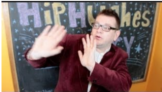
The Foreign Policy Dance Review