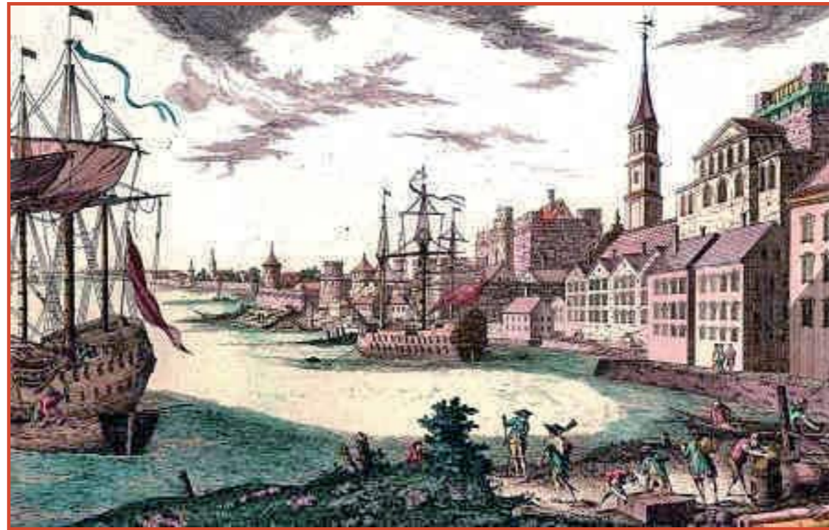
Port of Boston in 1774

Less than a year following the "Intolerable Acts" including the Massachusetts Government Act of 1774 the American Revolution erupted.