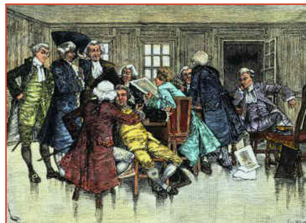
Colonial Town Meeting

The Massachusetts Government Act was designed to punish the inhabitants of Boston, Massachusetts for the incident that would become known as the Boston Tea Party . The Massachusetts Government Act was one of a series of British Laws referred to as the Intolerable Acts passed by the Parliament of Great Britain 1774.