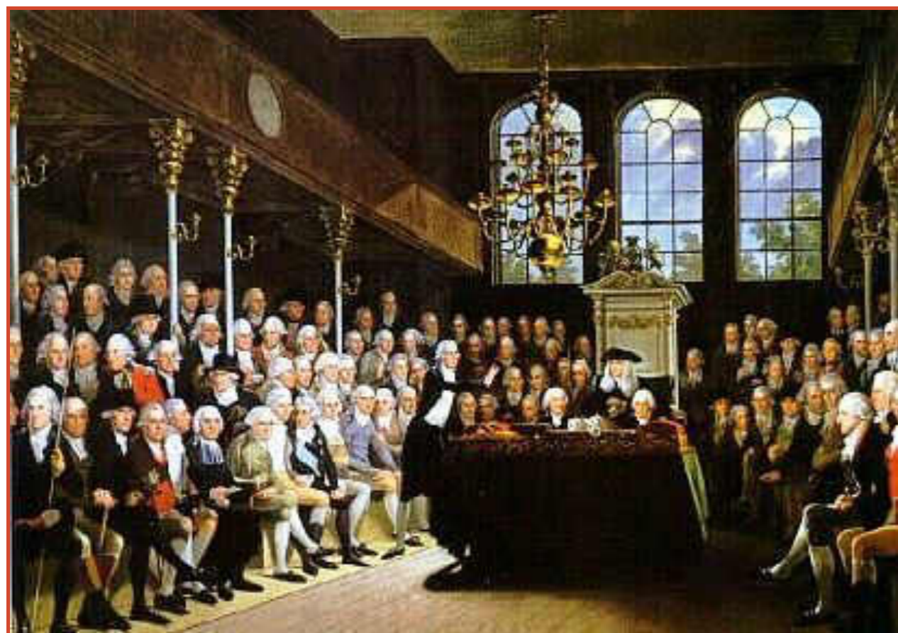
The Massachusetts Government Act was passed in Parliament

This article on the Massachusetts Government Act in Colonial America provides fast facts and information about the effects of these laws and taxes.